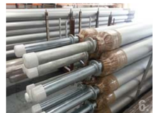
1. Dramatically shaped high peak design 2. Both twin pole and single pole designs are available 3. Clean and simple aluminum perimeter plates make connections to guyouts easy 4. Typical stake bar and web winch used for anchoring the tent system 5. Interior of 100' wide twin pole design 6. Heavy duty centerpoles and specially designed pole pins.